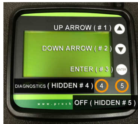
SIDE KEYBOARD (older model)

Step #5 - Program Unit's Cart ID – Power Up the Unit by pressing ▲ (#1). The Unit will load and display the logo screen after a minute or two.