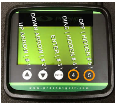
BOTTEM KEYBOARD (newer model)

Step #4 - Secure the Unit In Place – Secure the back cover over the arm, then using the T-15 Torques Screwdriver, screw the 6 screws into the 6 screw holes. Do not tighten the screws initially. Once all the screws are in, then do a final lap and tighten all 6 screws firmly.